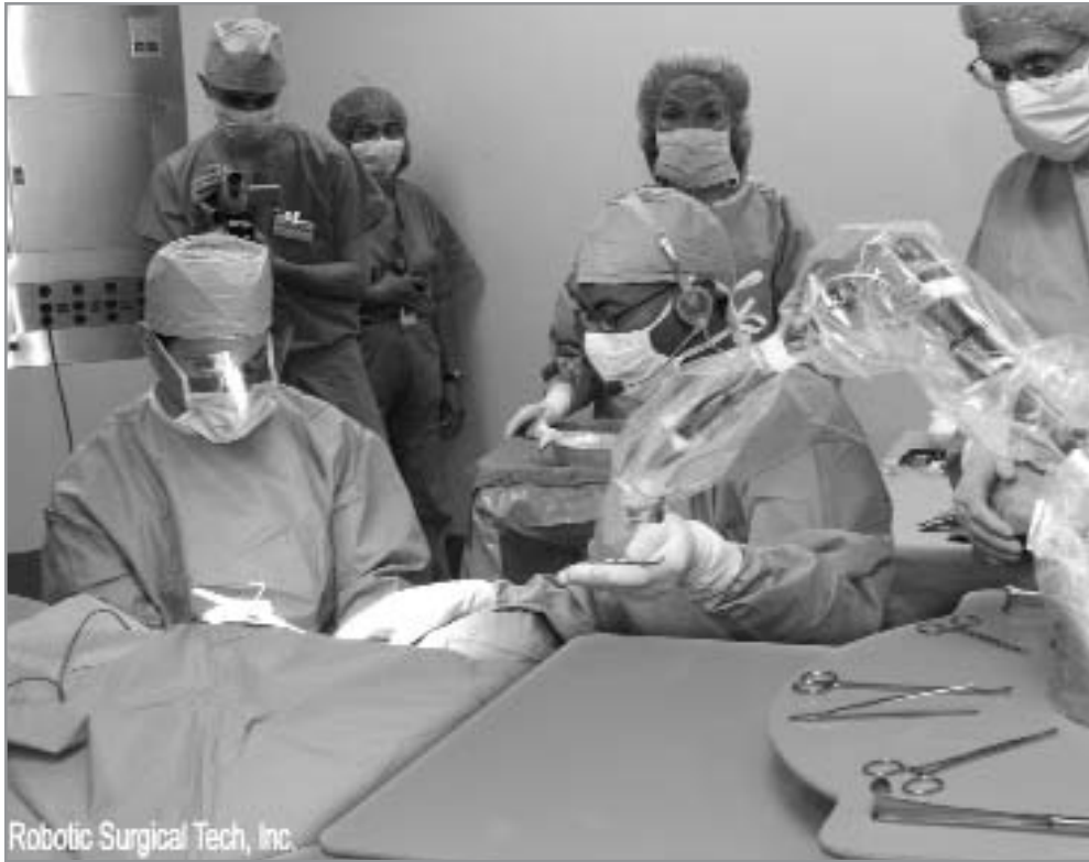
Scene from the operating room of the Allen Pavilion of NewYork-Presbyterian Hospital, June 16, 2005

Continued from "The Penelope Project" page 6